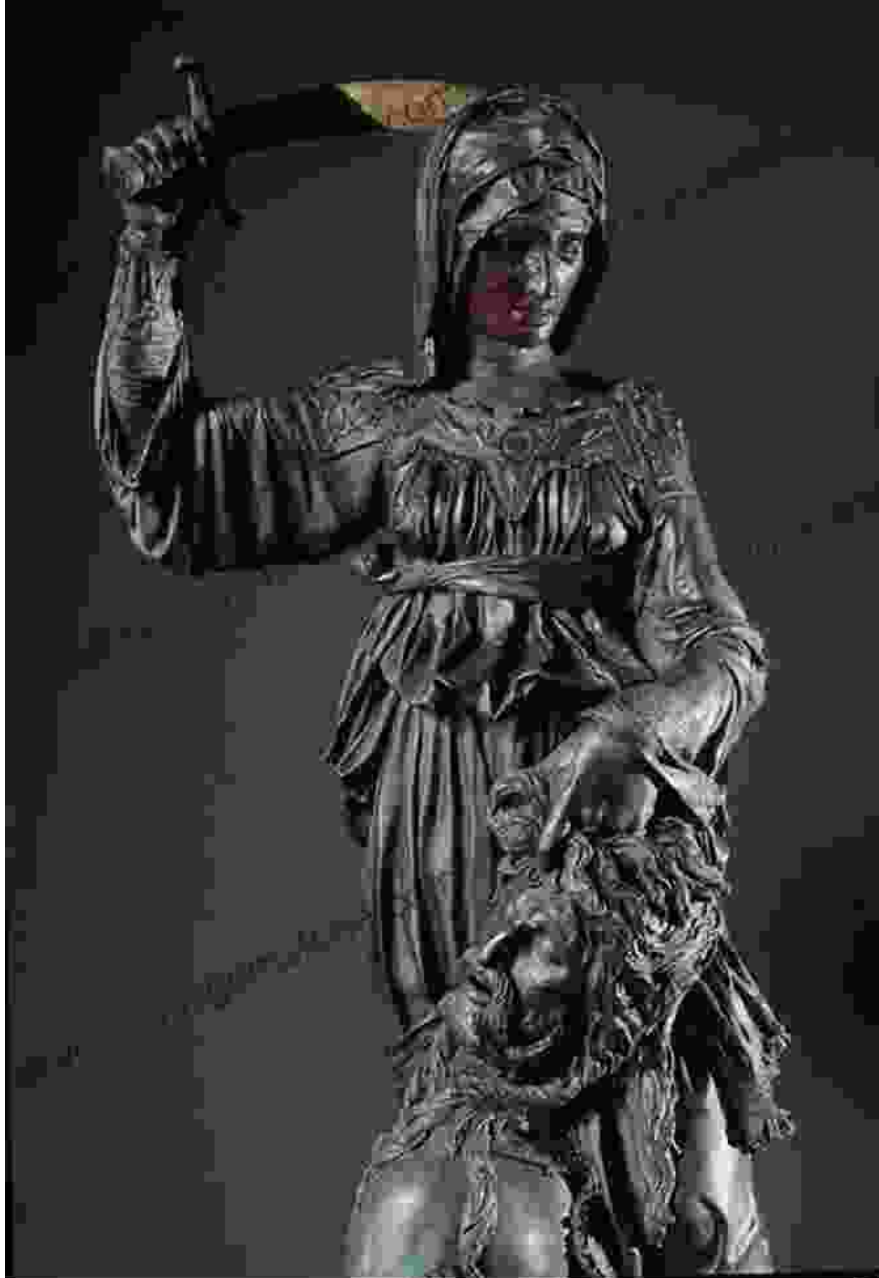
Judith and Holofernes, c. 1455-1460, bronze, Palazzo Vecchio, Florence