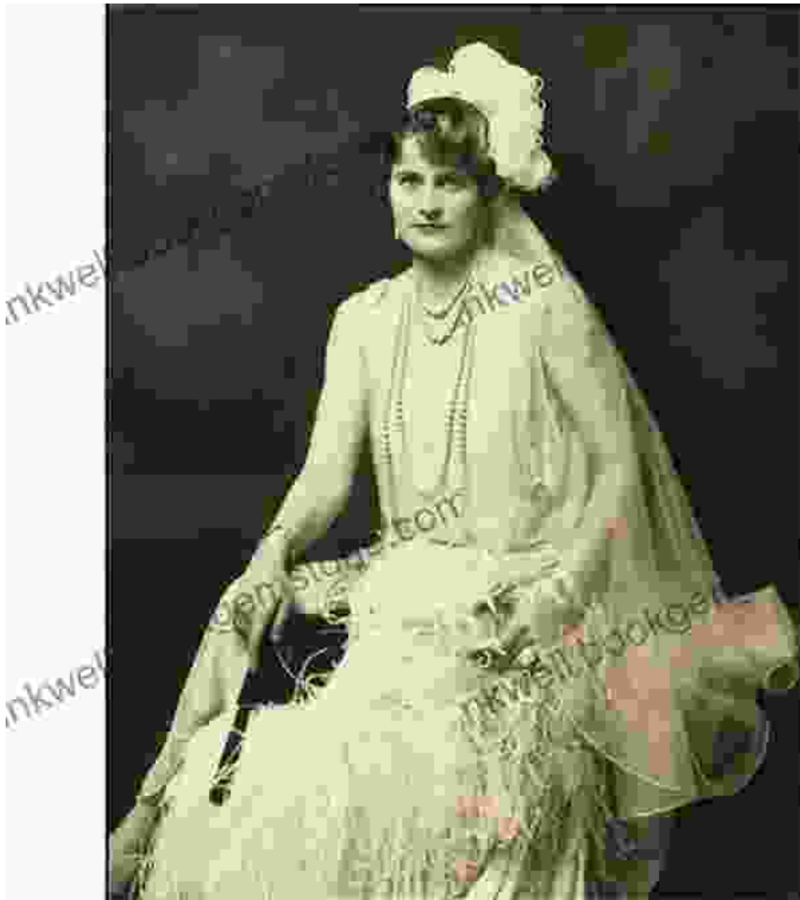
Marjorie Merriweather Post in 1920