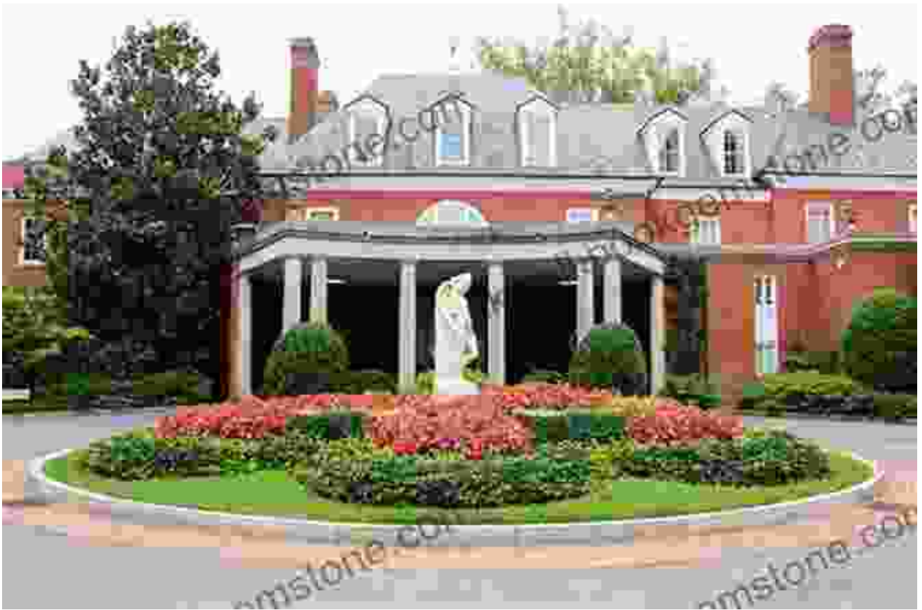
Hillwood Estate in Washington, D.C.