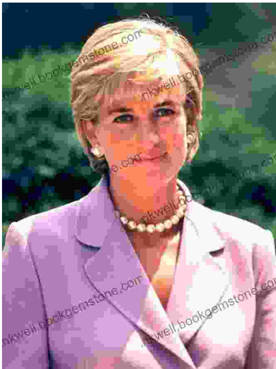
Lady Diana, Princess of Wales

legacy is one of love, kindness, and service, and she continues to inspire people around the world to make a difference in the lives of others.