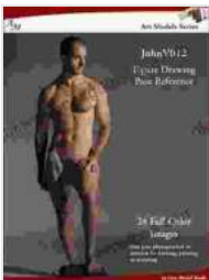
Figure drawing is the art of capturing the human form on paper or canvas. It is a challenging but rewarding skill that can enhance your overall drawing abilities. Whether you are a beginner or an experienced artist, using figure drawing pose reference art models can significantly improve your work.