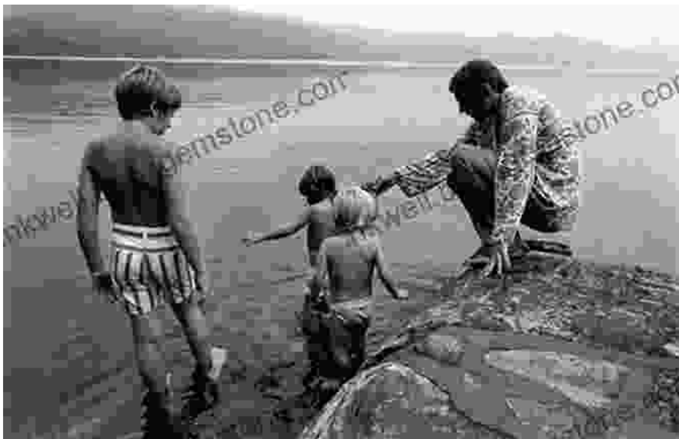
The Sutherland family on their boat, Elsewhere

The Sutherlands plan to continue sailing Elsewhere for many years to come. They have no set itinerary and are open to whatever adventures come their way. They are also excited to share their story with others and inspire them to follow their dreams.