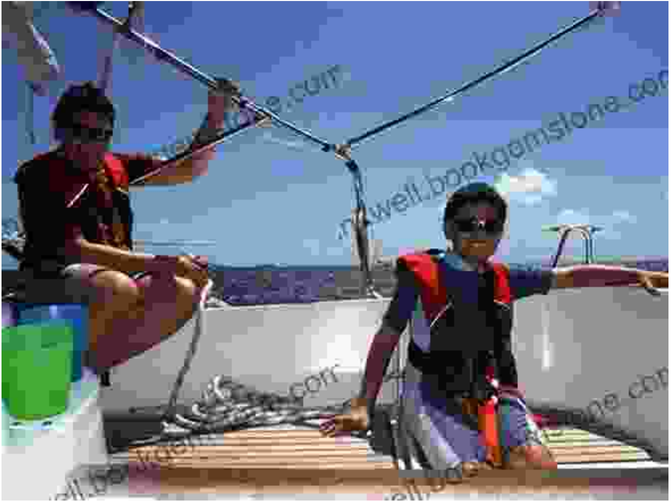
The Sutherland family sailing in the Caribbean